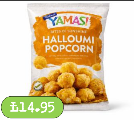
Frozen Halloumi Popcorn 1Kg