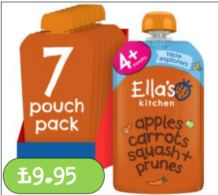
Squash, Carrot, Apple & Prune Puree From 4 Months 7 x 120g