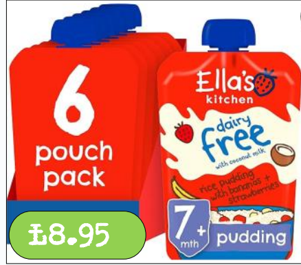
Dairy Free– Banana & Strawberry Rice Pudding 6 x 80g