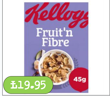
Portion Packs- Fruit & Fibre 40 x 45g