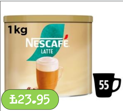
Nescafe- Latte Gold 1Kg