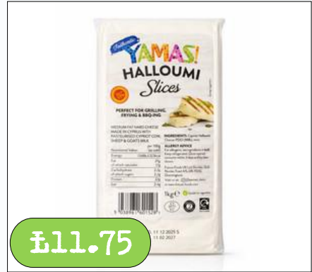
Sliced Halloumi– 1Kg