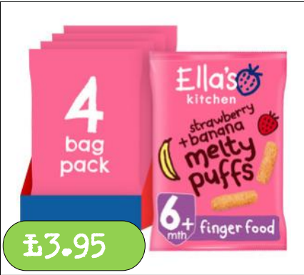
Melty Puffs– Strawberry & Banana From 6 Months 4 x 20g