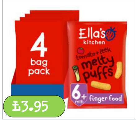
Melty Puffs– Tomato & Leek From 6 Months 4 x 20g