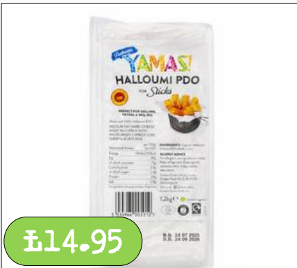
Halloumi Sticks– 1.2Kg