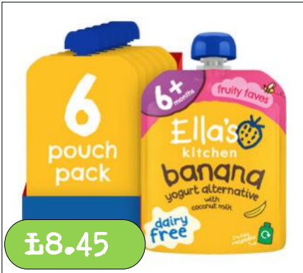
Dairy Free– Banana Yoghurt From 6 Months 6 x 90g