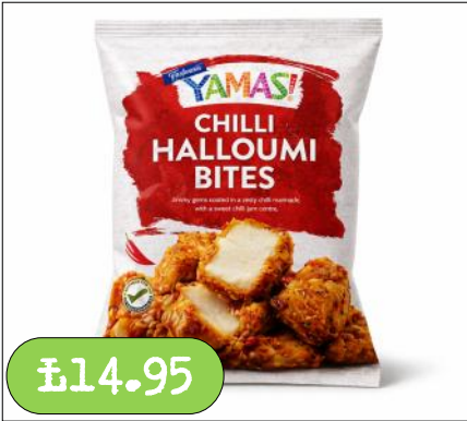
Frozen Chilli Halloumi Bites– 1Kg