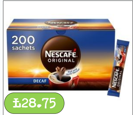
Nescafe- Decaffeinated Coffee Sticks x 200