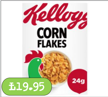
Portion Packs- CornFl akes 40 x 24g