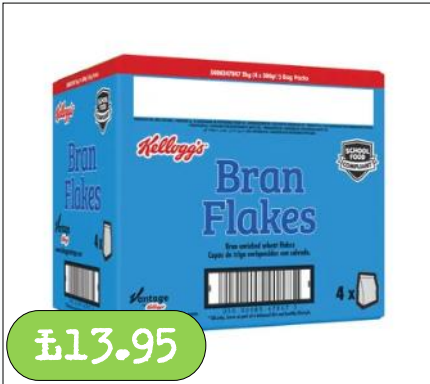
Bag Packs- Bran Flakes 4 x 500g