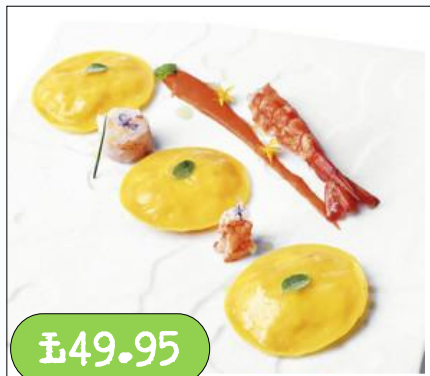
Ravioli- Scrigni With Apulia Barrata 2Kg