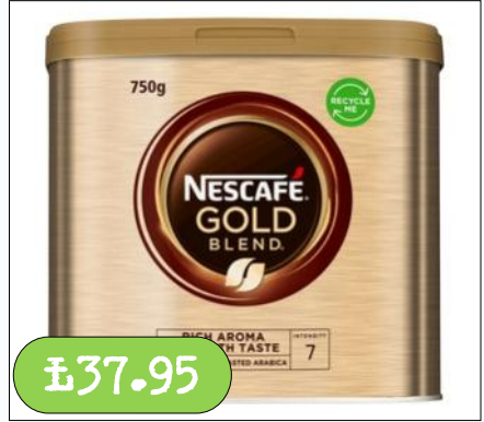
Nescafe- Gold Blend Instant Coffee 750g