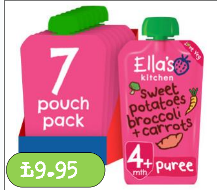
Sweet Potato, Broccoli & Carrot Puree From 4 Months 7 x 120g