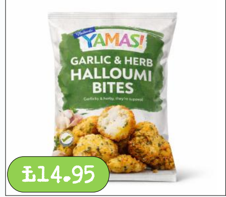
Frozen Garlic & Herb Halloumi Bites 1Kg