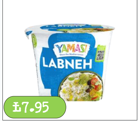
Labneh– 6 x 200g