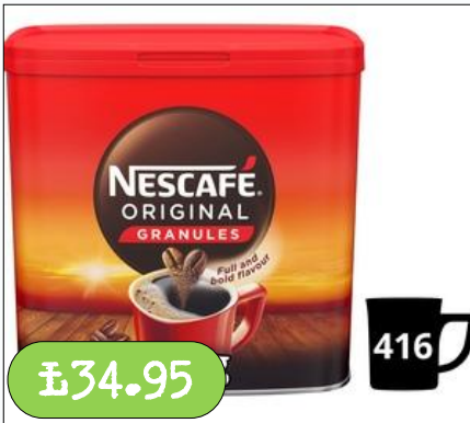
Nescafe- Original Granules 750g