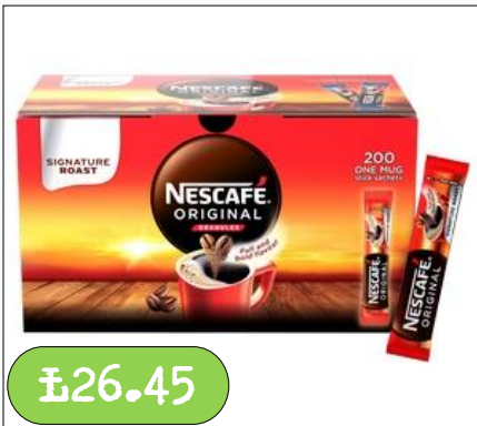
Nescafe- Original Coffee Sticks X 200