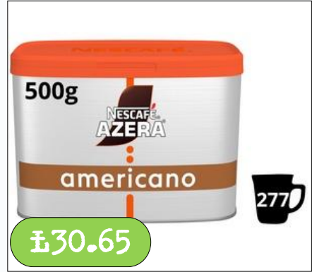
Nescafe- Azera Americano Instant Coffee 500g