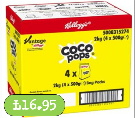
Bag Packs- Coco Pops 4 x 500g