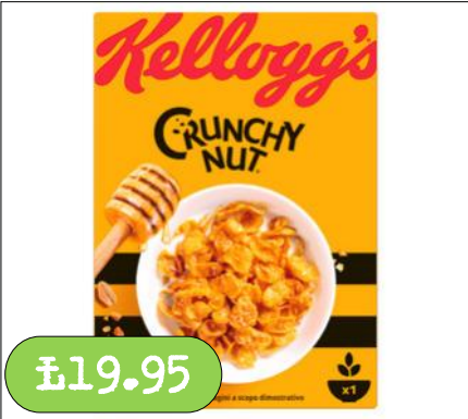
Portion Packs- Crunchy Nut 40 x 35g