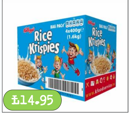
Bag Packs- Rice Krispies 4 x 400g