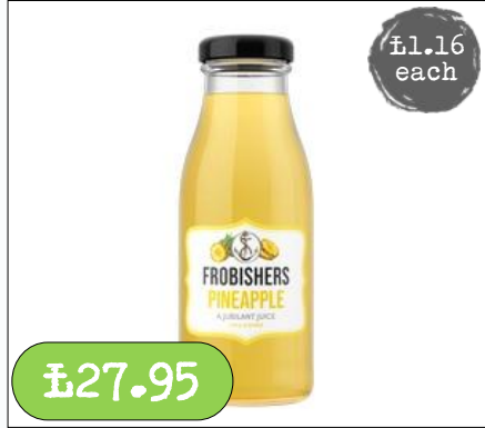
Jubilant Juice- Pineapple 24 x 250ml