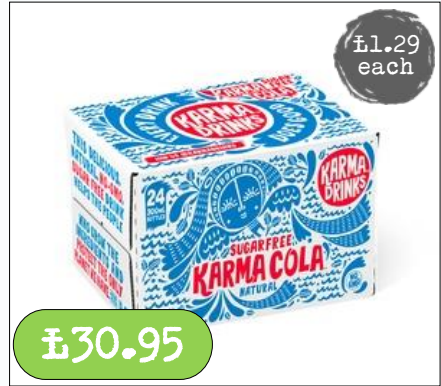
Sugar Free Cola- 24 x 300ml