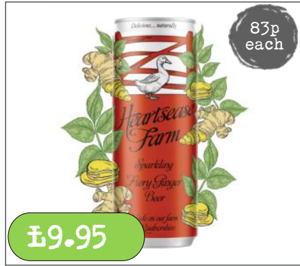
Heartsease Farm- Fiery Ginger Beer 12 x 330ml