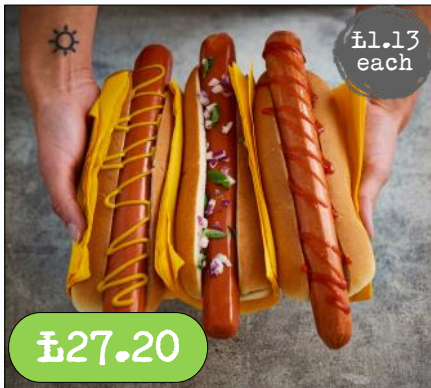
Moving Mountains- Hot Dog Frankfurter 24 x 90g