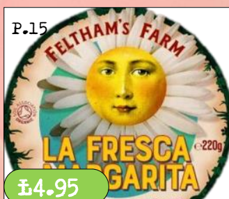
Feltham's Farm La Fresca