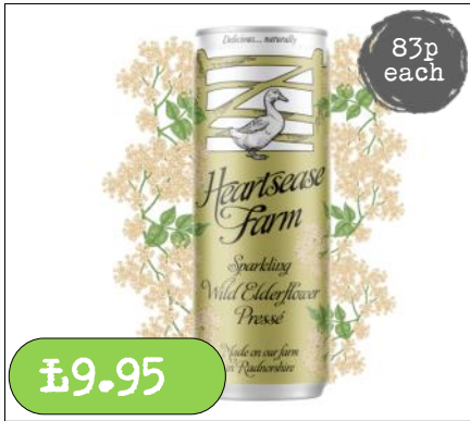
Heartsease Farm- Wild Elderflower 12 x 330ml