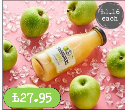
Jubilant Juice- Apple 24 x 250ml