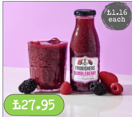
Jubilant Juice- Bumbleberry 24 x 250ml