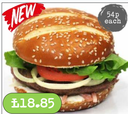
£18.85 Bretzel Bun- 35 x 65g