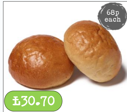
Speciality Breads- Eden Potato Burger Bun 45 x 90g