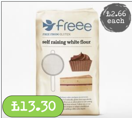
Self Raising- Flour 5 x 1Kg