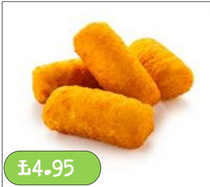
Potato Croquettes- 2.5Kg