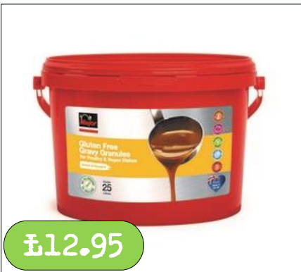
Major– Poultry Gravy Granules GF Vegan 2Kg