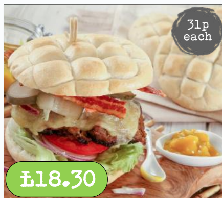
£18.30 White Turtle Roll- 60 x 80g