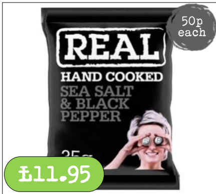
Sea Salt & Black Pepper- 24 x 35g