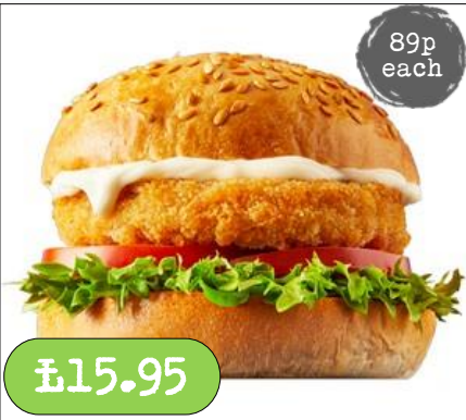
No Chicken- Chicken Burger 18 x 125g