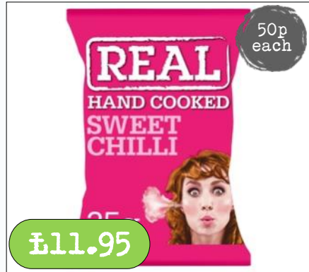
Sweet Chilli- 24 x 35g