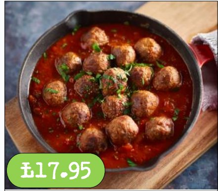
No Meat- Meatballs 17g 2Kg