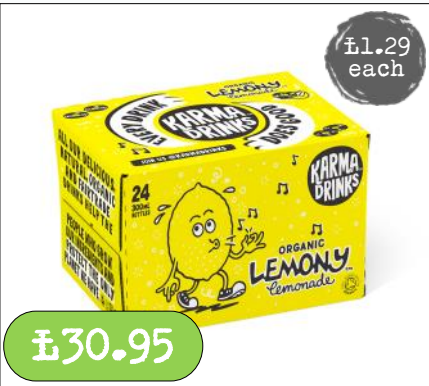
Lemony Lemonade- 24 x 300ml