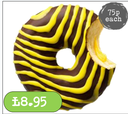
Queen V- 1 x 12