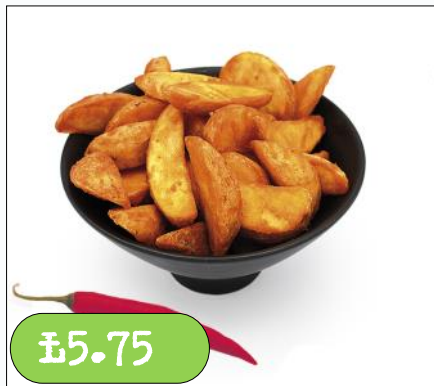
Spicy Potato Wedges- 2.5Kg