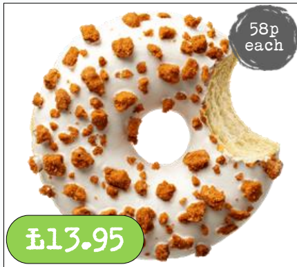
Spectacular Vegan- x 24