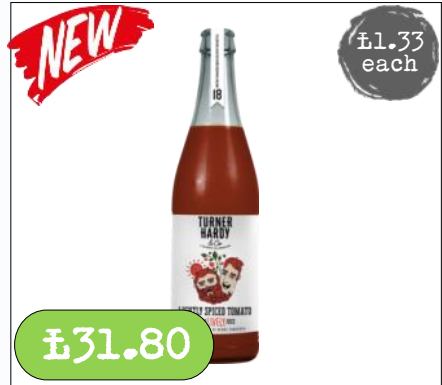
Turner Hardy- The Lively One 24 x 250ml