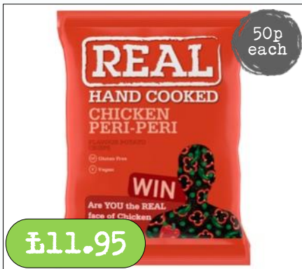
Peri- Peri Chicken- 24 x 35g