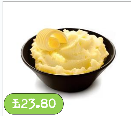
Gourmet Mashed Potatoes- 10Kg