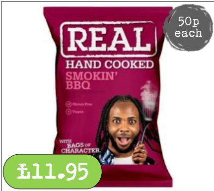
Smokin' BBQ- 24 x 35g