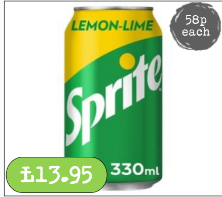
Sprite- 24 x 330ml