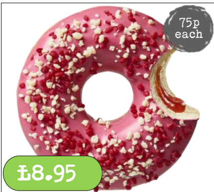
Berry White- 1 x 12