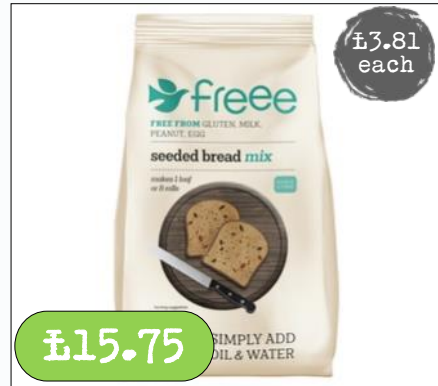
Seeded Bread Mix- 4 x 1Kg