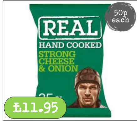
Strong Cheese & Onion- 24 x 35g