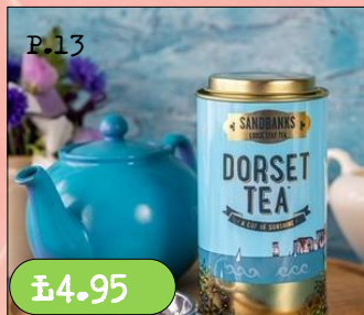
Sandbanks Loose Leaf