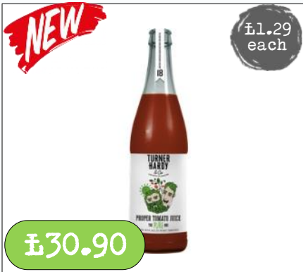
Turner Hardy- The Pure One 24 x 250ml