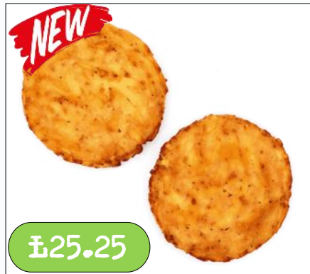
Rosti Burger 90g- 4 x 2.5Kg