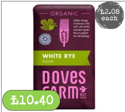
Rye Flour- White 5 x 1Kg