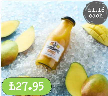
Jubilant Juice- Mango 24 x 250ml