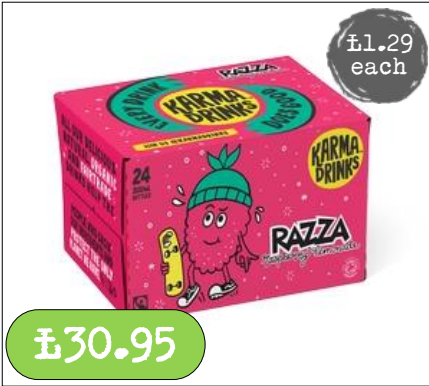
Razza Raspberry Lemonade- 24 x 300ml