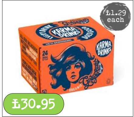
Gingerella Ginger Ale- 24 x 300ml