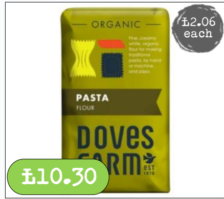
00- Pasta Flour 5 x 1Kg