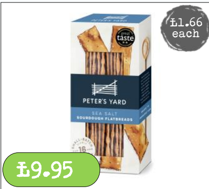
Peter's Yard– Sourdough Flatbreads Sea Salt 6 x 115g