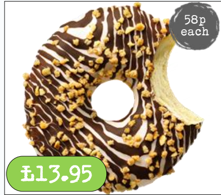
Nutty Zafari Vegan- x 24