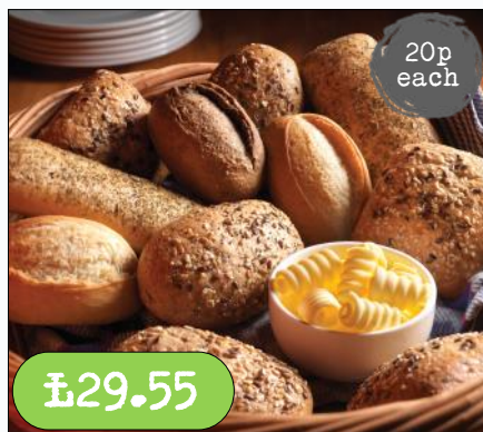
£29.55 French Bakers Basket- Mini Rolls 150 x 50g