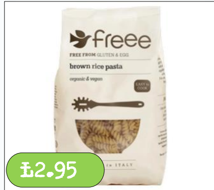
Doves Farm– Gluten Free Brown Rice Penne 500g