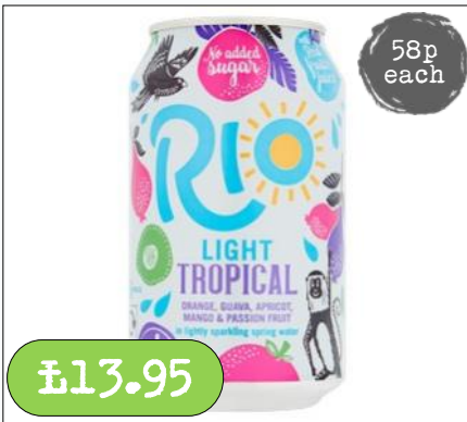
Rio Tropical- Sugar Free 24 x 330ml