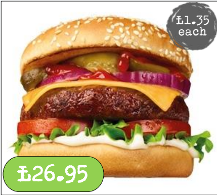
Vegan Burger- 20 x 114g