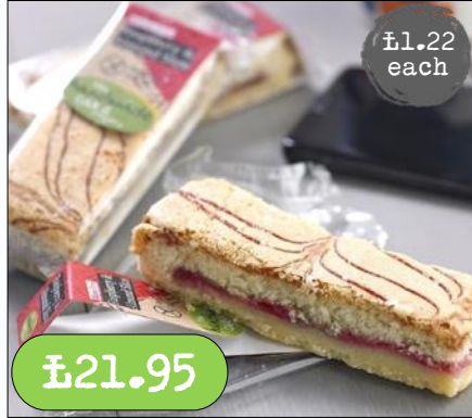
HCC– Raspberry & Almond Slice 18 x 70g