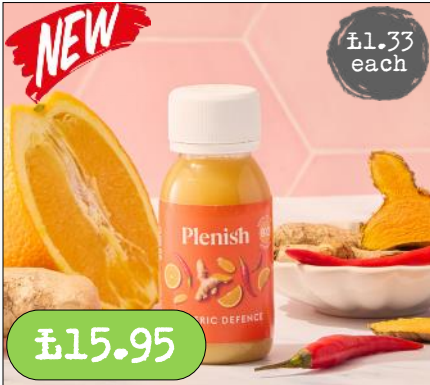
Plenish- Turmeric Defence Shot 12 x 60ml