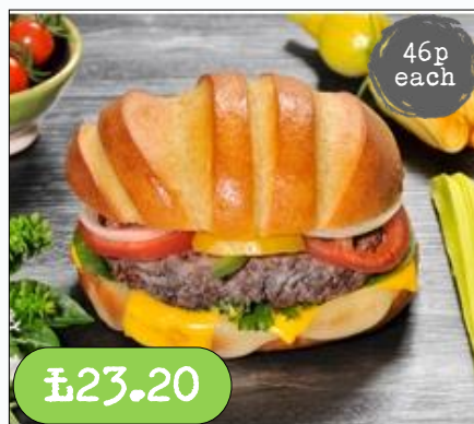
£23.20 Brioche Bear Bun- 50 x 100g