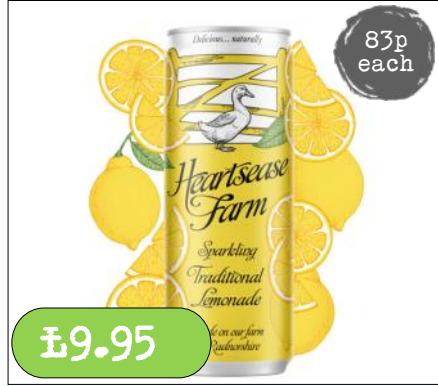
Heartsease Farm- Lemonade 12 x 330ml