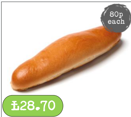
Speciality Breads- Glazed Eden Potato Hot Dog Roll 36 x 95g