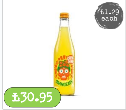
Orangeade- 24 x 300ml