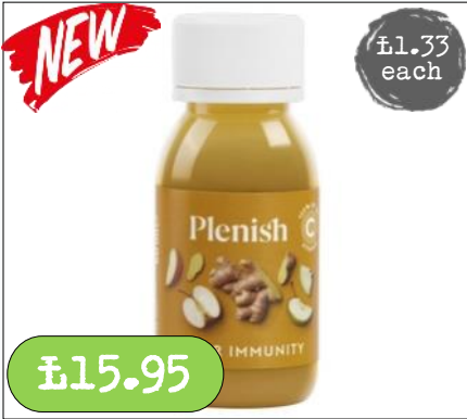
Plenish- Ginger Immunity Shot 12 x 60ml