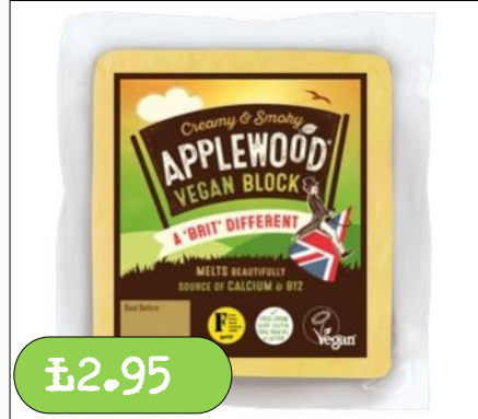
Applewood- Smoked Applewood Block 200g