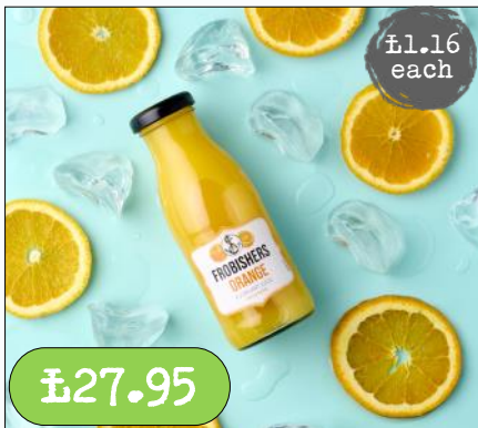
Jubilant Juice- Orange 24 x 250ml