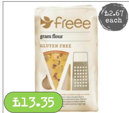
Gram Flour- Chick Pea Flour 5 x 1Kg