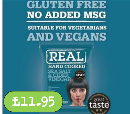
Sea Salt & Cider Vinegar- 24 x 35g