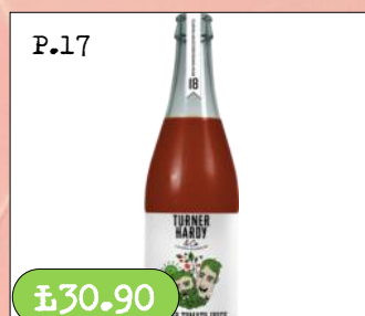
Turner Hardy 24 x 250ml