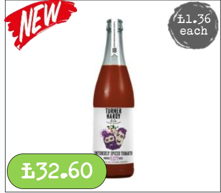
Turner Hardy- The Feisty One 24 x 250ml