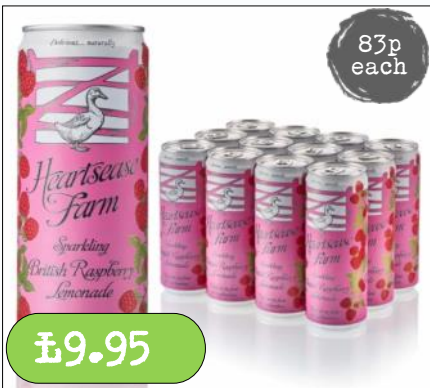
Heartsease Farm- Raspberry Lemonade 12 x 330ml