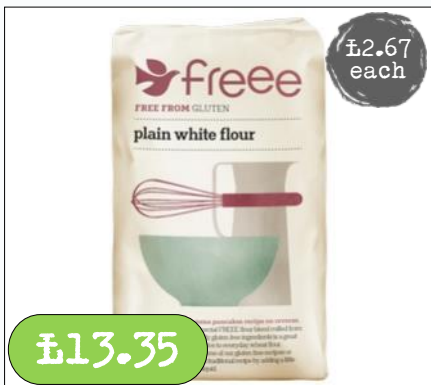
Plain White- Flour 5 x 1Kg