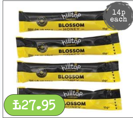
Hilltop Honey– Blossom Honey Stick 200 x 15g