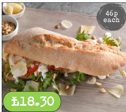
£18.30 Sourdough Baguette White Demi-Bisontine 40 x 140g