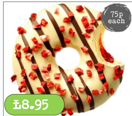
Strawjelly Jam- 1 x 12