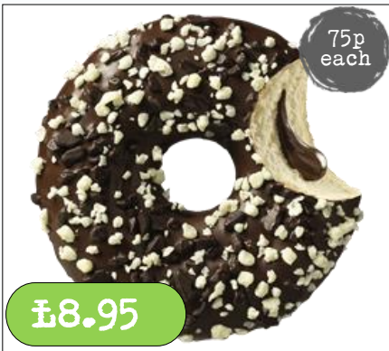
The Belgium- 1 x 12