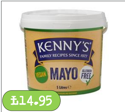
Kenny's- Vegan Mayonnaise 5 Litre