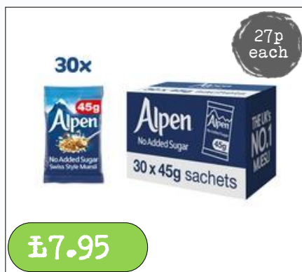
Alpen- Original Sachets 30 x 45g