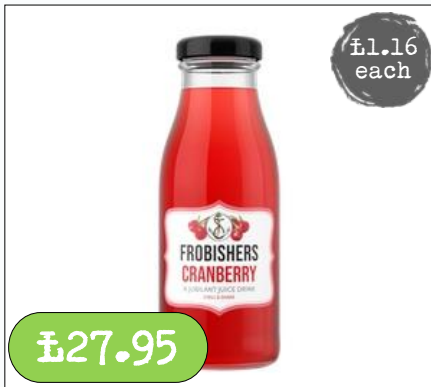
Jubilant Juice- Cranberry 24 x 250ml