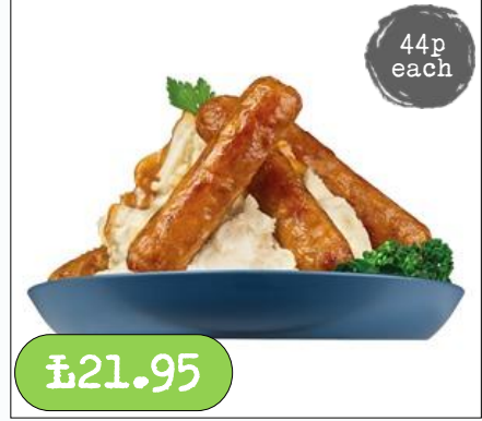
Vegan Sausage- 50 x 40g