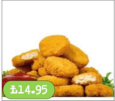
No Chicken- Chicken Nugget 21g 2Kg