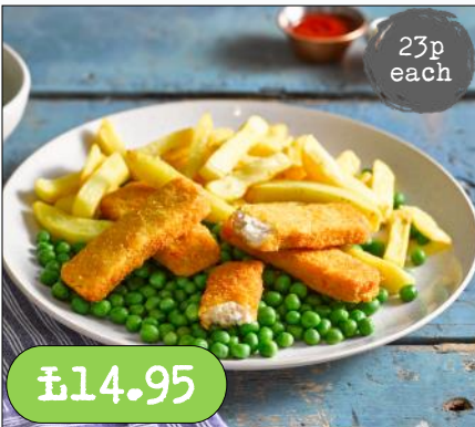
No Fish- Fish Finger x 64 2Kg