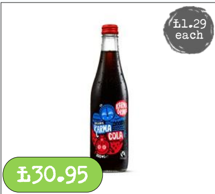
Cola- 24 x 300ml