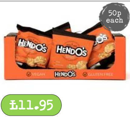
Henderson's– Relish Flavour Crisp GF 24 x 33g