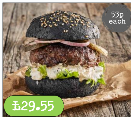
£29.55 Black Brioche Roll- Seeded 56 x 90g