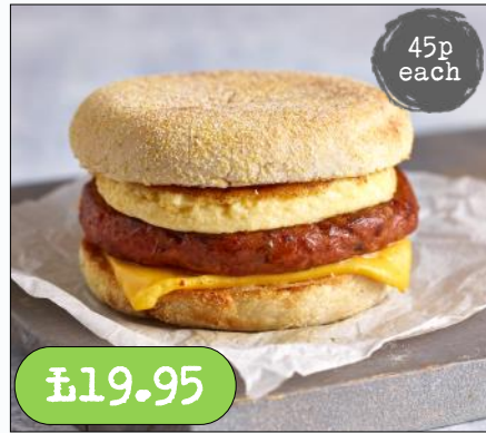
Moving Mountains- Brunch Patties 44 x 56g