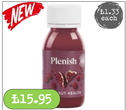
Plenish- Berry Gut Health Shot 12 x 60ml