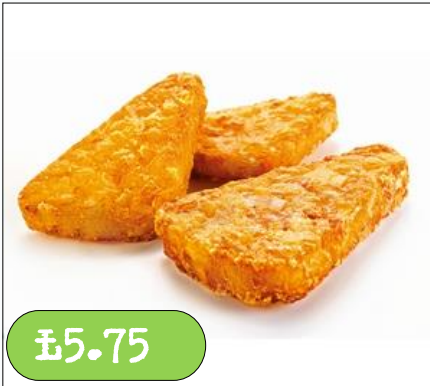
Crunchy Hash Browns- 2.5Kg