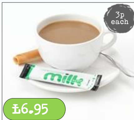
Lakeland- Semi Skimmed Milk Sticks 240 x 10ml