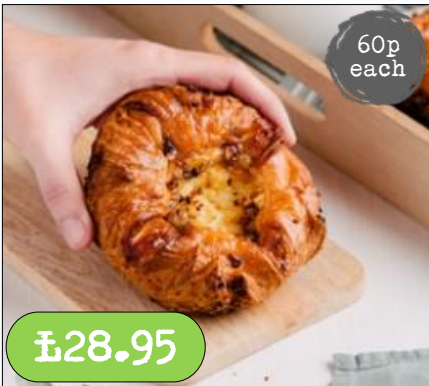
Vanilla Couronne - Vegan Crown 48 x 90g