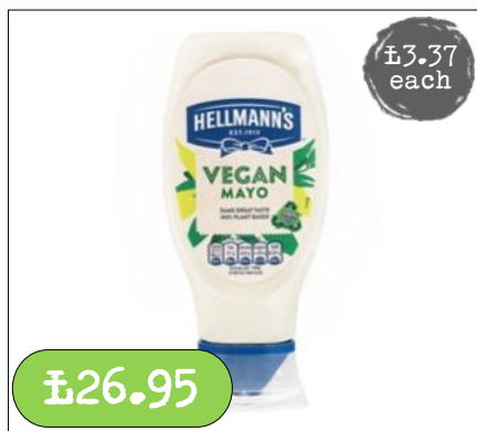
Hellmann's- Vegan Squeezy Mayonnaise 8 x 430ml