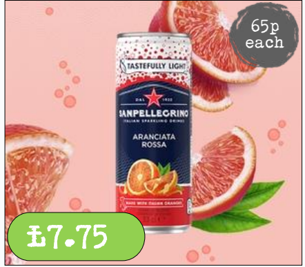
Blood Orange- 12 x 330ml