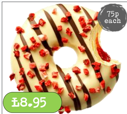
Strawjelly Jam- x 12