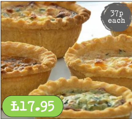
Frank Dale- Mini Vegetarian Quiche 48 x 21g