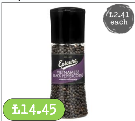
Epicure-Vietnamese Black Peppercorn Grinder 6 x 50g