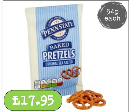
Penn State- Pretzels Original Sea Salted 33 x 30g