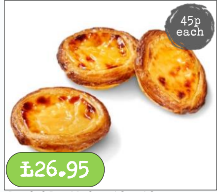
Pastel De Nata- 60 x 60g