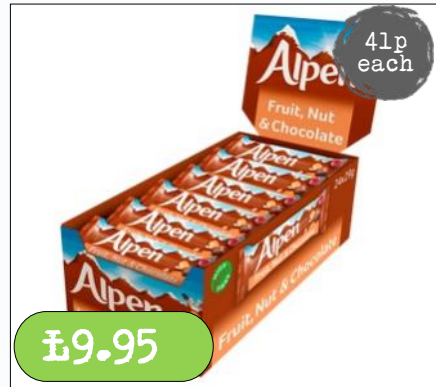
Alpen Bar– Fruit, Nut & Chocolate 24 x 29g