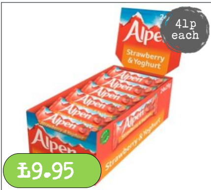
Alpen Bar– Strawberry & Yoghurt 24 x 29g