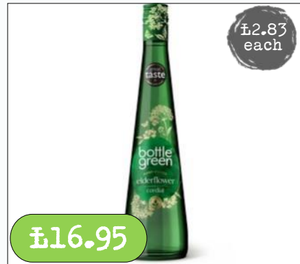
Cordial- Elderflower 6 x 750ml