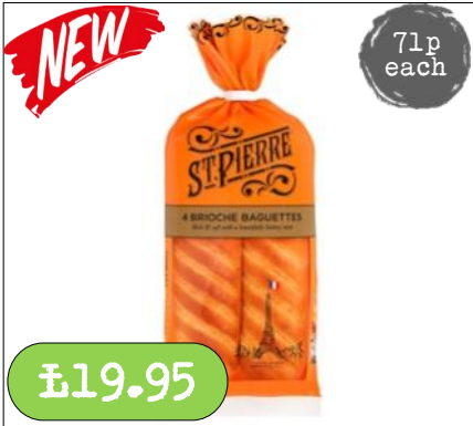
St Pierre-Brioche Baguette 4 x 7