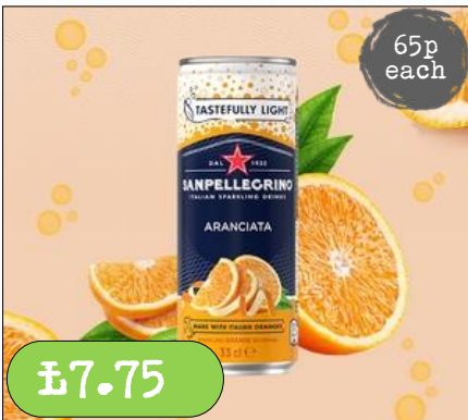
Aranciata Orange- 12 x 330ml