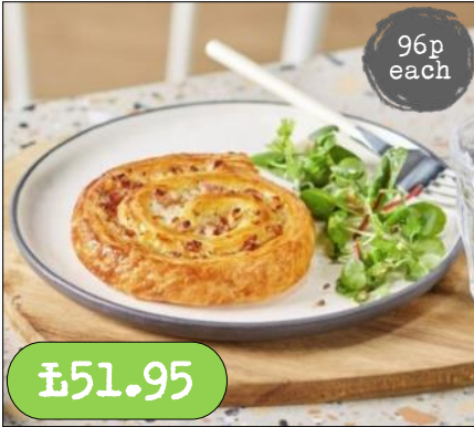
Ham & Cheese Swirl- 54 x 120g