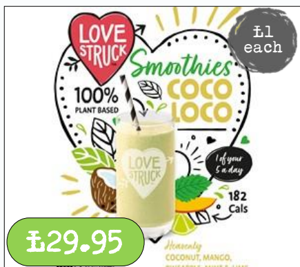
£29.95 Fruit Smoothie– Coco Loco 30 x 140g