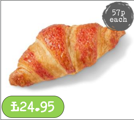
Vegan Raspberry Filled Croissant- 44 x 90g