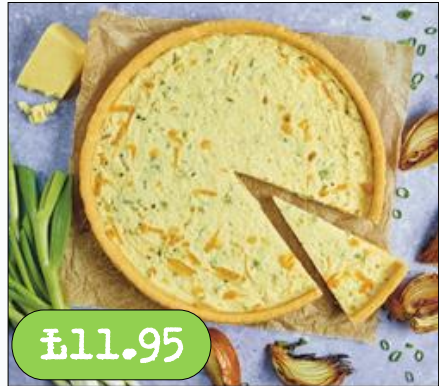
Menuserve- Quiche Cheese & Onion 11Inch