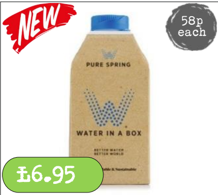
Water In A Box- Still Spring Water 12 x 500ml