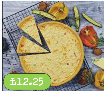
Menuserve- Spanish Mediterranean Vegetable 11In