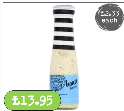
Pizza Express- House Dressing 6 x 235ml