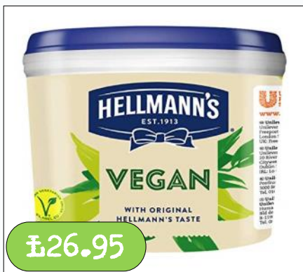
Hellmann's- Vegan Mayonnaise 5 Litre