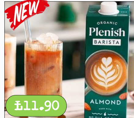
Plenish- Organic Barista Almond M*lk 6 x 1Litre