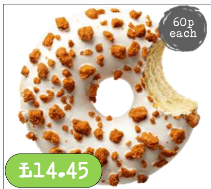
Spectaculous (Vegan) - x 24