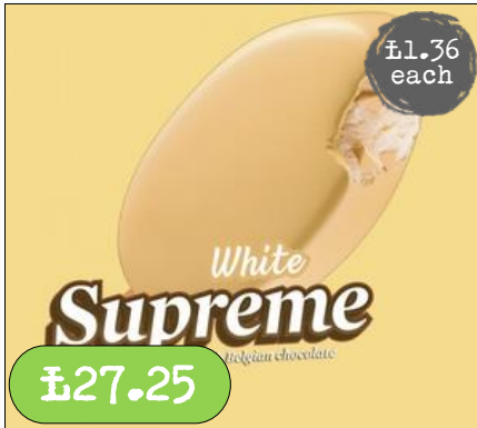
Supreme- White Chocolate 20 x 120ml