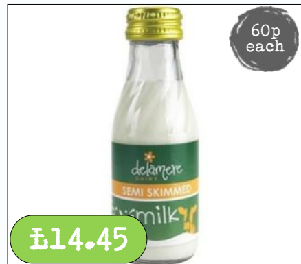
Delamere- Mini Milk Glass Bottle Semi Skimmed 24 x 97ml