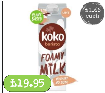
Koko- Barista Foamable Milk 12 x 1Litre