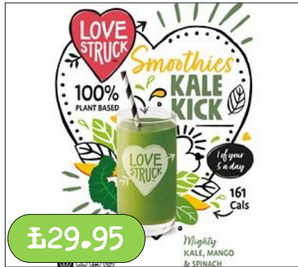
£29.95 Vegetable Smoothie– Kale Kick 30 x 140g