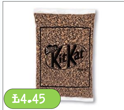
Nestle– Mix-In Kit Kat Pieces 400g