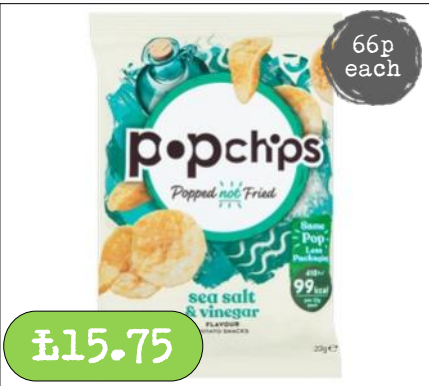
Popchips- Salt & Vinegar 24 x 23g