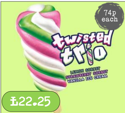
Twisted Trio- 30 x 80ml