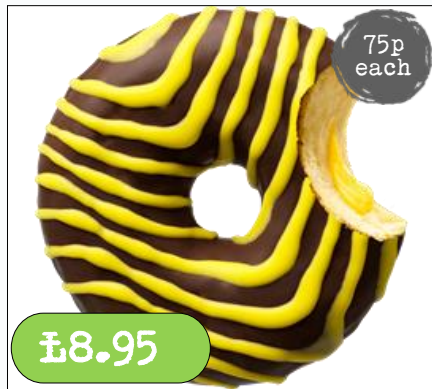
Queen V- x 12