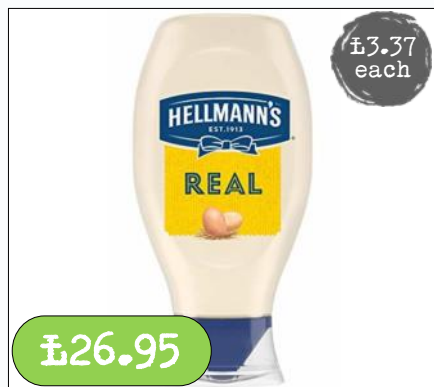
Hellmann's- Squeezy Mayonnaise 8 x 430ml