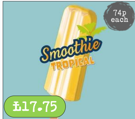
Smoothie Tropical- Dairy Free 24 x 70g