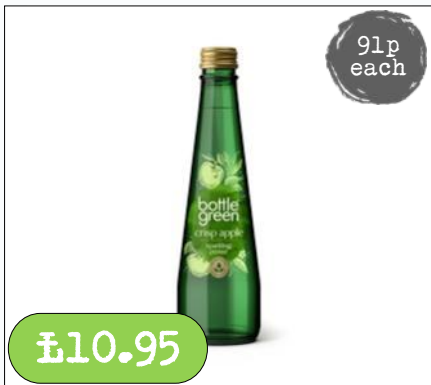
Sparkling Presse- Crisp Apple 12 x 275ml