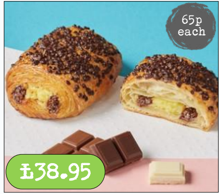
Triple Chocolate Extravagant- 60 x 95g