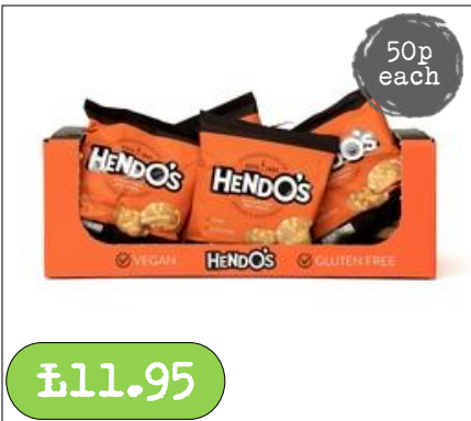
Hendos's- Relish Flavour Crisp Vegan GF 24 x 23g