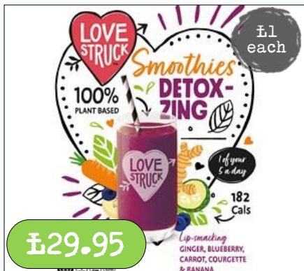
£29.95 Vegetable Smoothie– Detox-Zing 30 x 140g