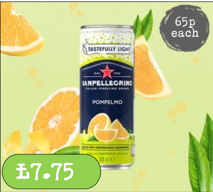
Grapefruit- 12 x 330ml