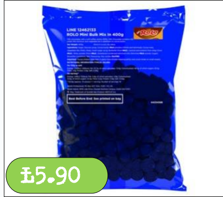
Nestle– Mix-In Mini Rolos 400g