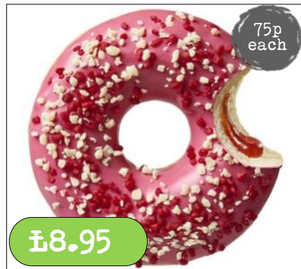
Berry White- x 12