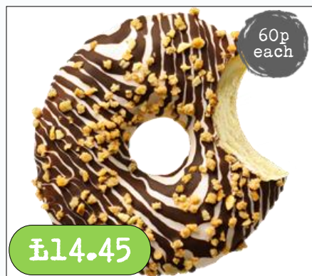
Nutty Zafari (Vegan) - x 24