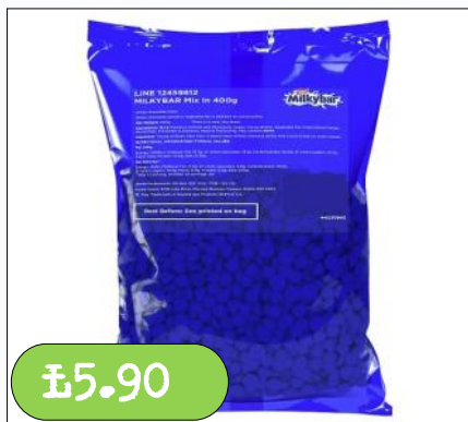
Nestle– Mix-in Mini Milky Bar Pieces 400g