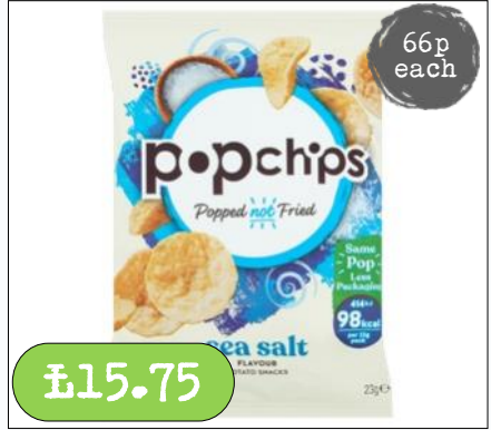
PopChips- Sea Salt 24 x 23g