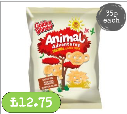
Golden Wonder- Animal Adventures Original 36 x 19g