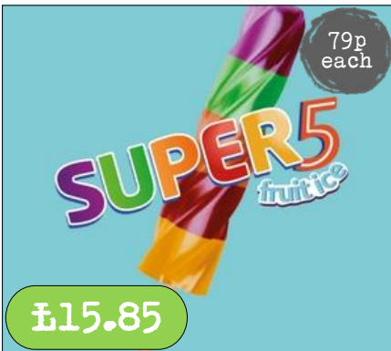
Super 5 Fruit Ice- 20 x 85ml