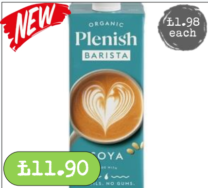
Plenish- Soya Organic Barista M*lk 6 x 1Litre