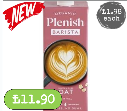
Plenish- Oat Organic Barista M*lk 6 x 1Litre