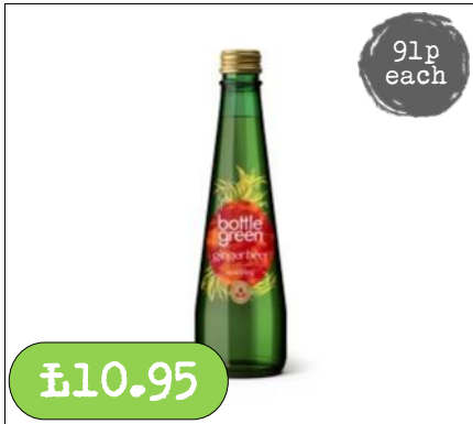
Sparkling Presse- Ginger Beer 12 x 275ml