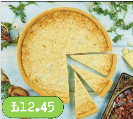
Menuserve-Quiche Lorraine 11Inch