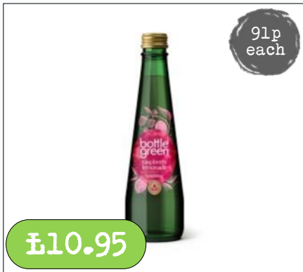
Sparkling Presse- Raspberry Lemonade 12 x 275ml