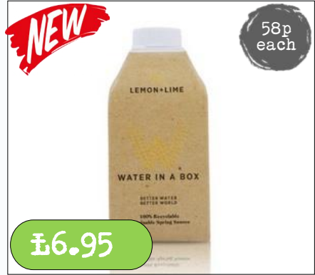
Water In A Box- Lemon & Lime 12 x 500ml