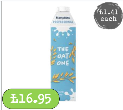
Framptons Professional- The Oat One Foamable 12 x 1Litre