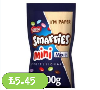
Nestle– Mix-In Mini Smarties 500g