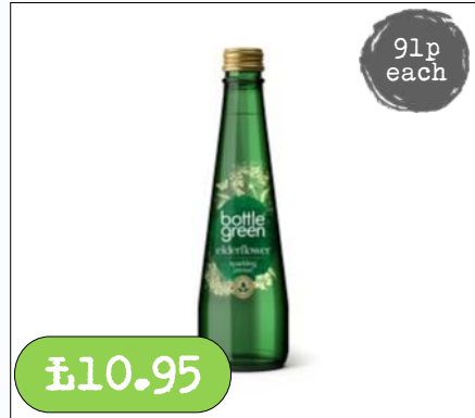
Sparkling Presse- Elderflower 12 x 275ml