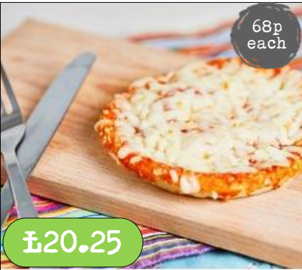
Capri Foods- 5" Pizza—Cheese & Tomato x 30