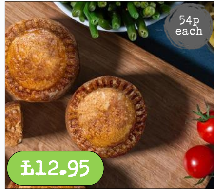
Pork Farms- Mini Buffet Pork Pie 24 x 65g