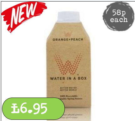
Water In A Box- Orange & Peach 12 x 500ml