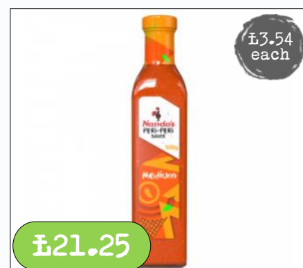
Nando's- Peri-Peri Medium Sauce 6 x 500ml