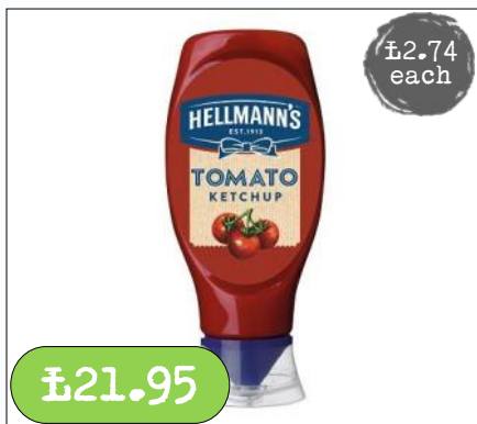
Hellmann's- Tomato Ketchup Squeezy 8 x 430ml