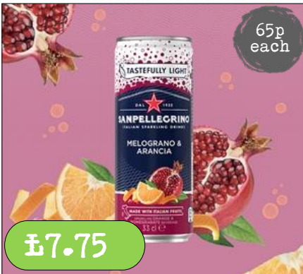
Pomegranate & Orange- 12 x 330ml