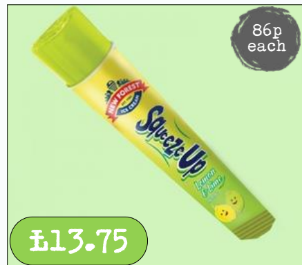
Squeeze Up- Lemon & Lime 16 x 110ml