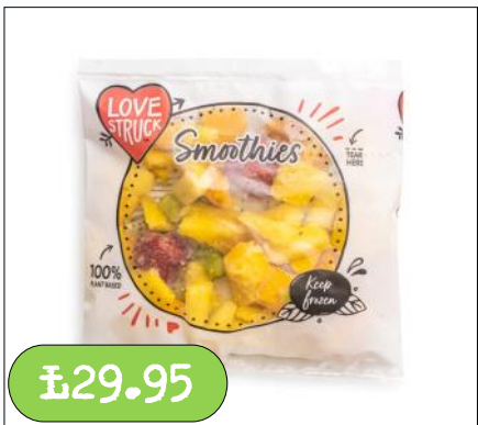
£29.95 Fruit Smoothie– Big 5 30 x 140g