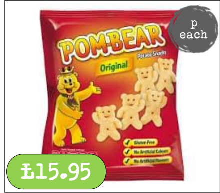
Pom-Bear- Original 36 x 19g