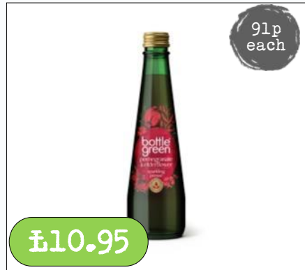
Sparkling Presse- Pomegranate & Elderflower 12 x 275ml