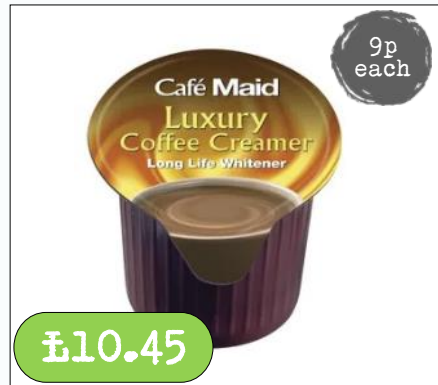
Café Maid- Cream Jiggers X 120