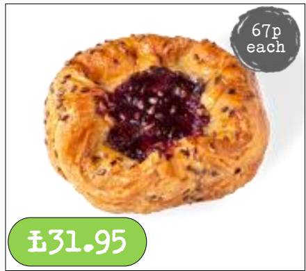
Cherry Couronne- Vegan Crown 48 x 90g