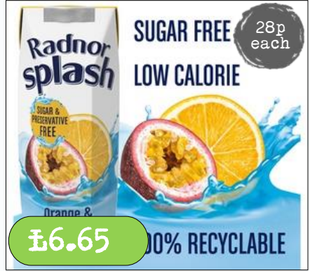
Radnor Splash- Orange & Passion Fruit 24 x 250ml