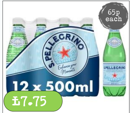
Sparkling Mineral Water- 12 x 500ml