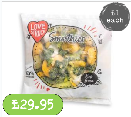
£29.95 Vegetable Smoothie– Avo Go-Go 30 x 140g