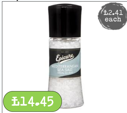
Epicure- Mediterranean Sea Salt Grinder 6 x 50g