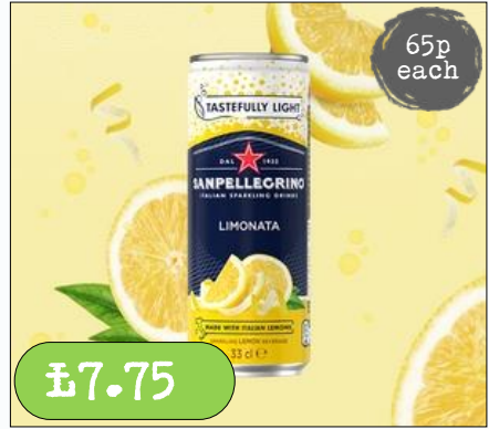
Limonata Lemon- 12 x 330ml