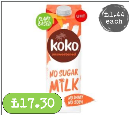
Koko- Coconut Milk Unsweetened 12 x 1Litre