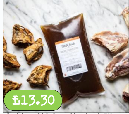
Beef Stock- 2.5Kg