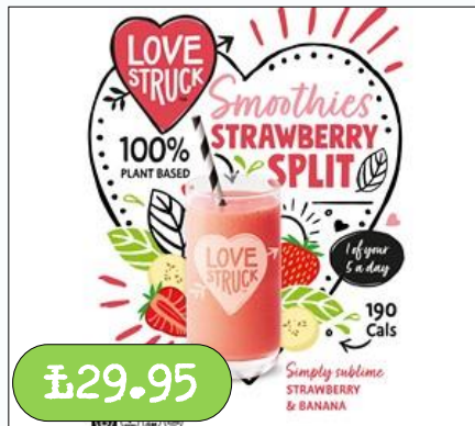
£29.95 Fruit Smoothie– Strawberry Split 30 x 140g