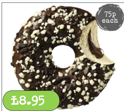
The Belgium- x 12